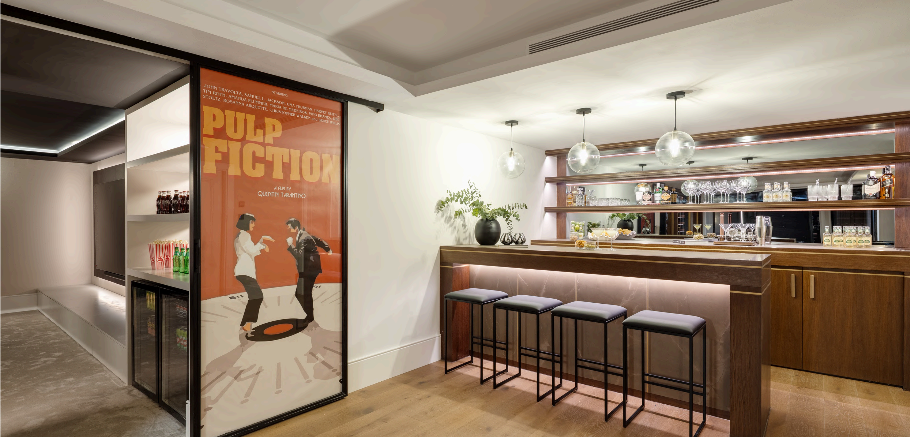
INTERIOR | RELAX AREA