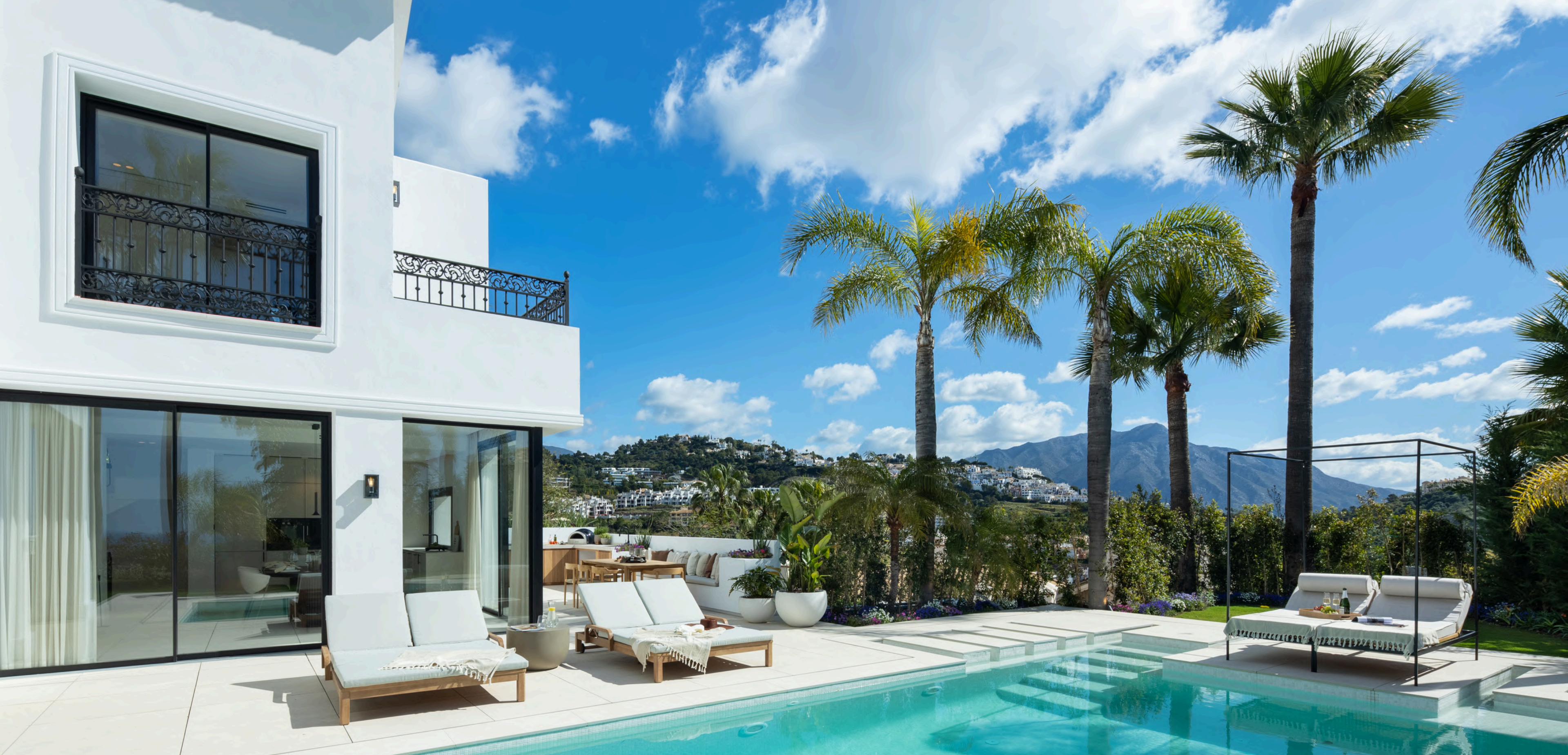
EXTERIORS | RELAX AREA & POOL