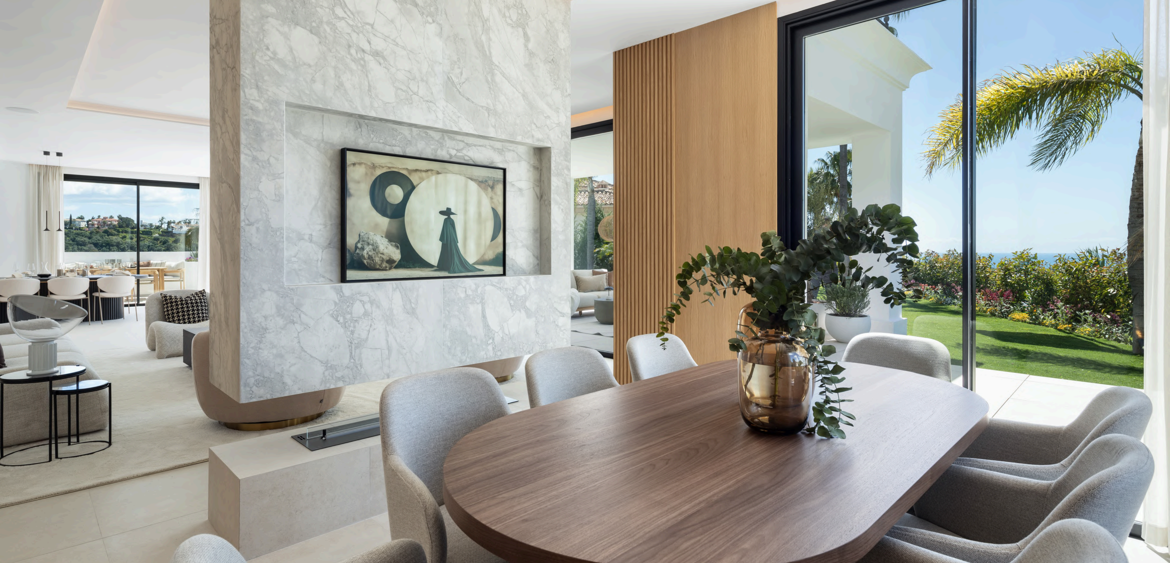
INTERIOR | DINING AREA