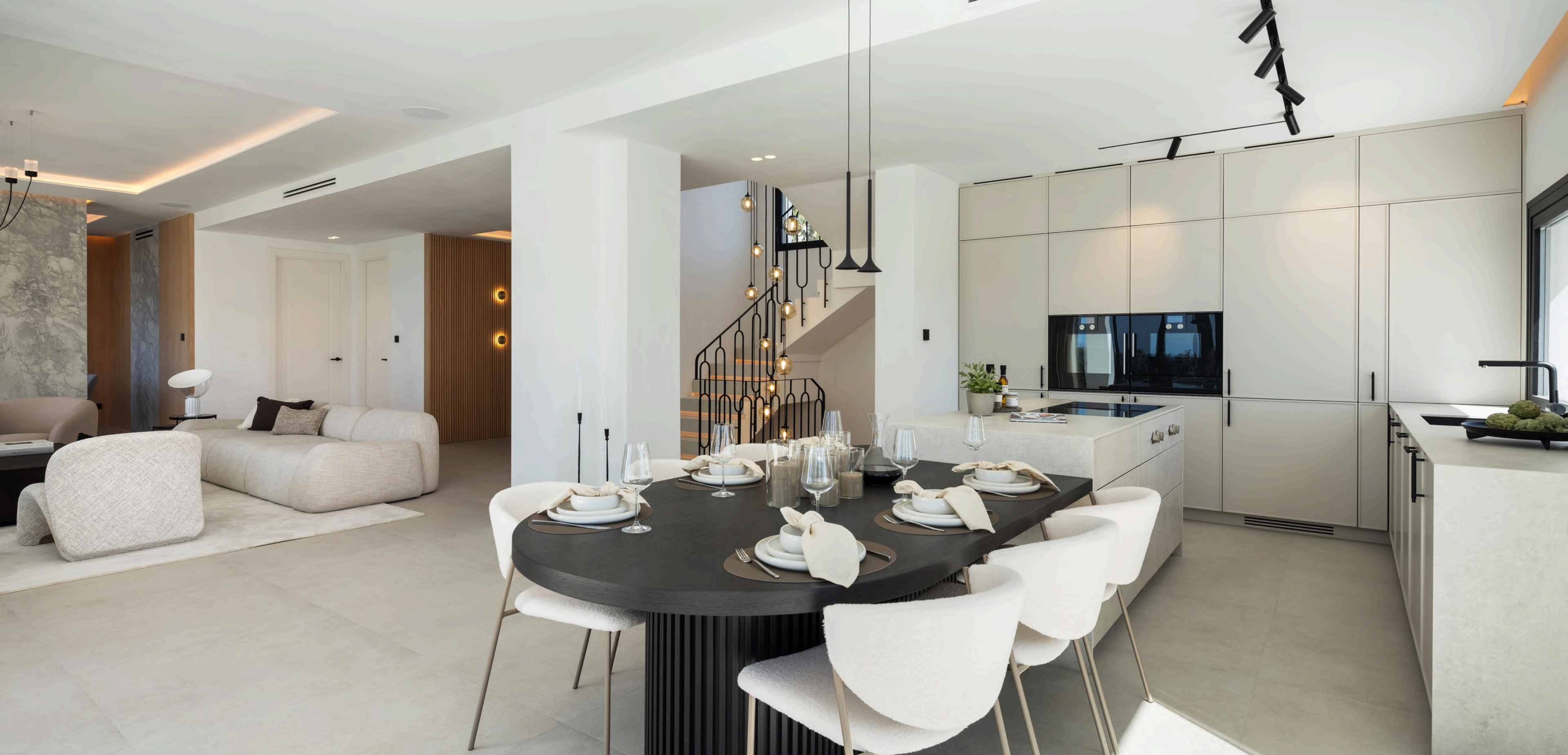
INTERIOR | DINING AREA