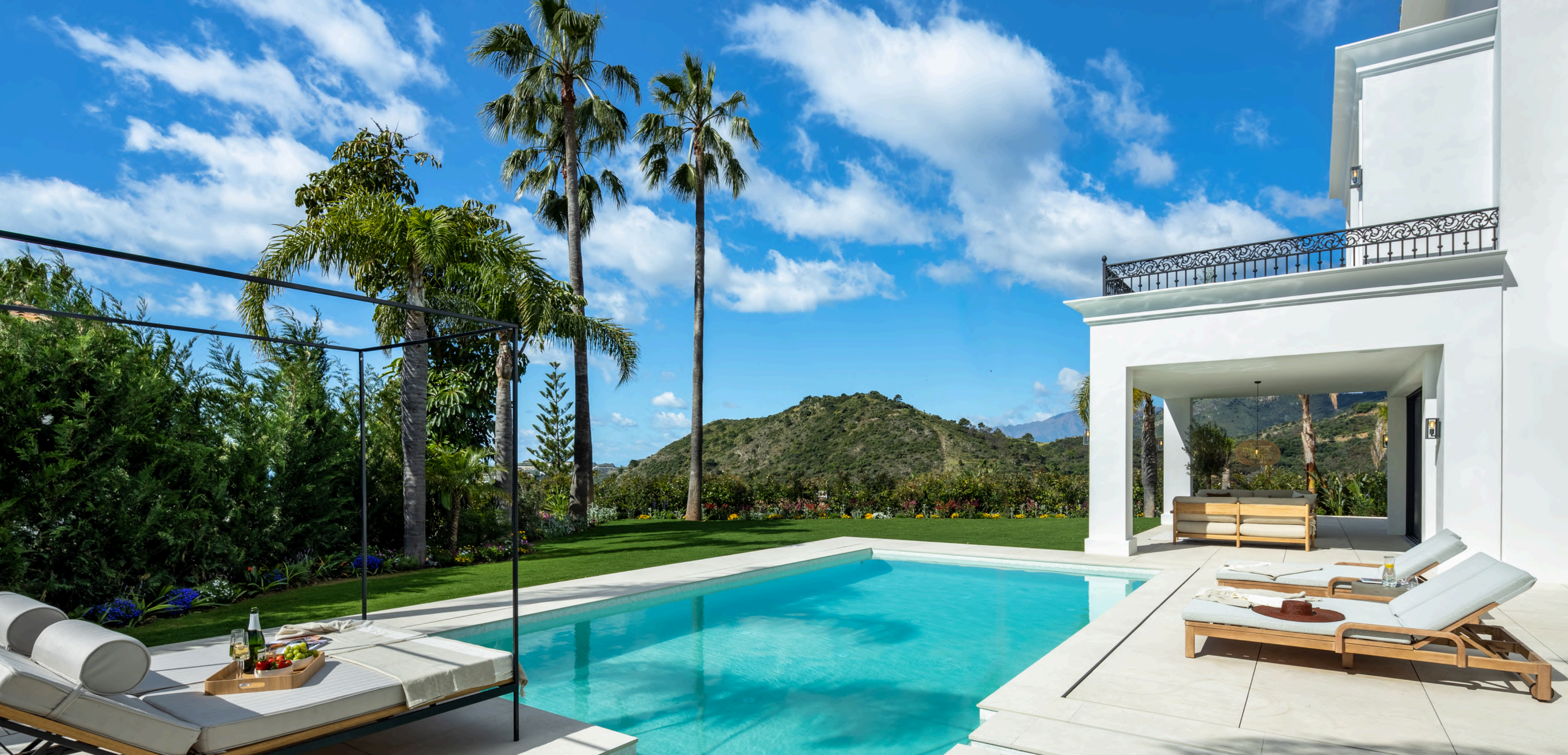
EXTERIORS | RELAX AREA & POOL