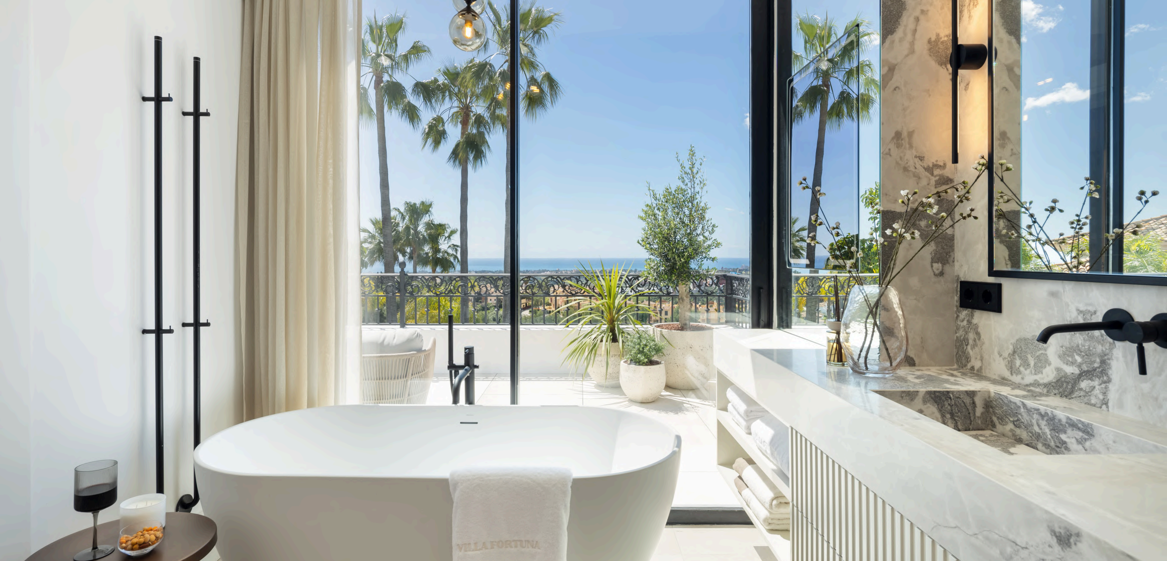
INTERIOR | BATHROOM 1