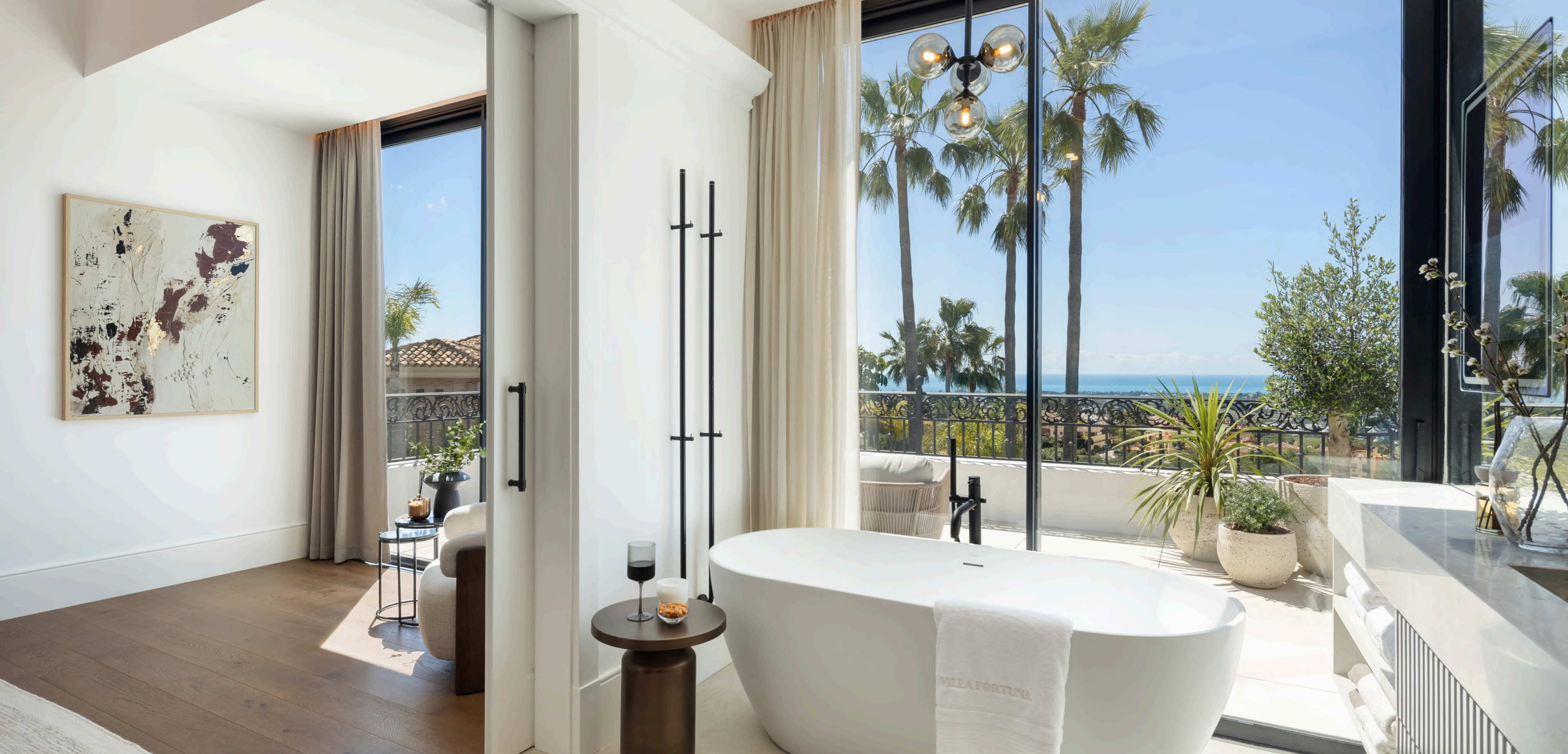
INTERIOR | BATHROOM 1