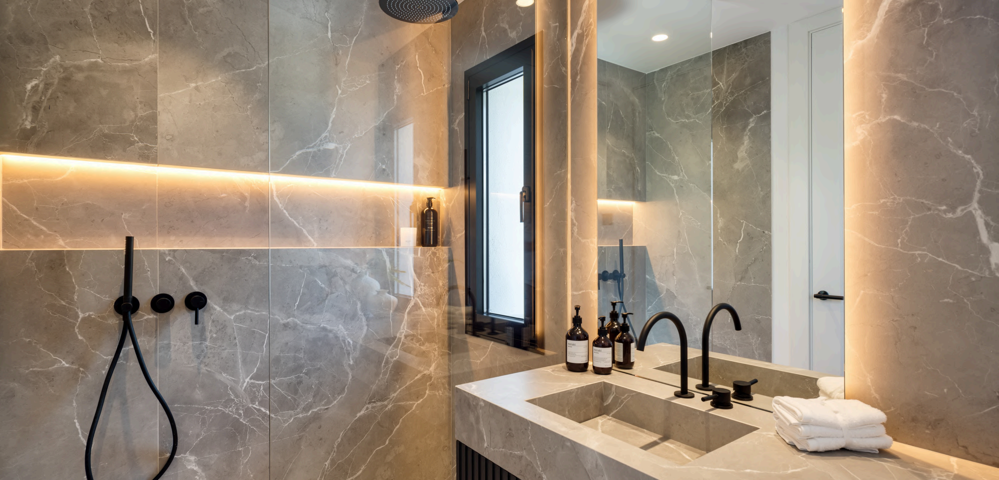
INTERIOR | BATHROOM 2