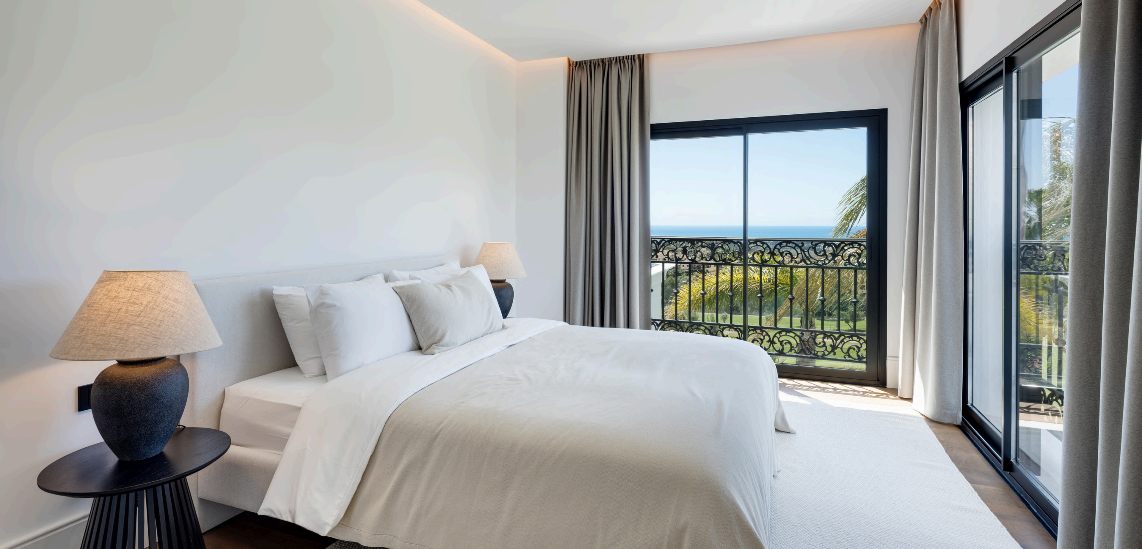
INTERIOR | BEDROOM 1