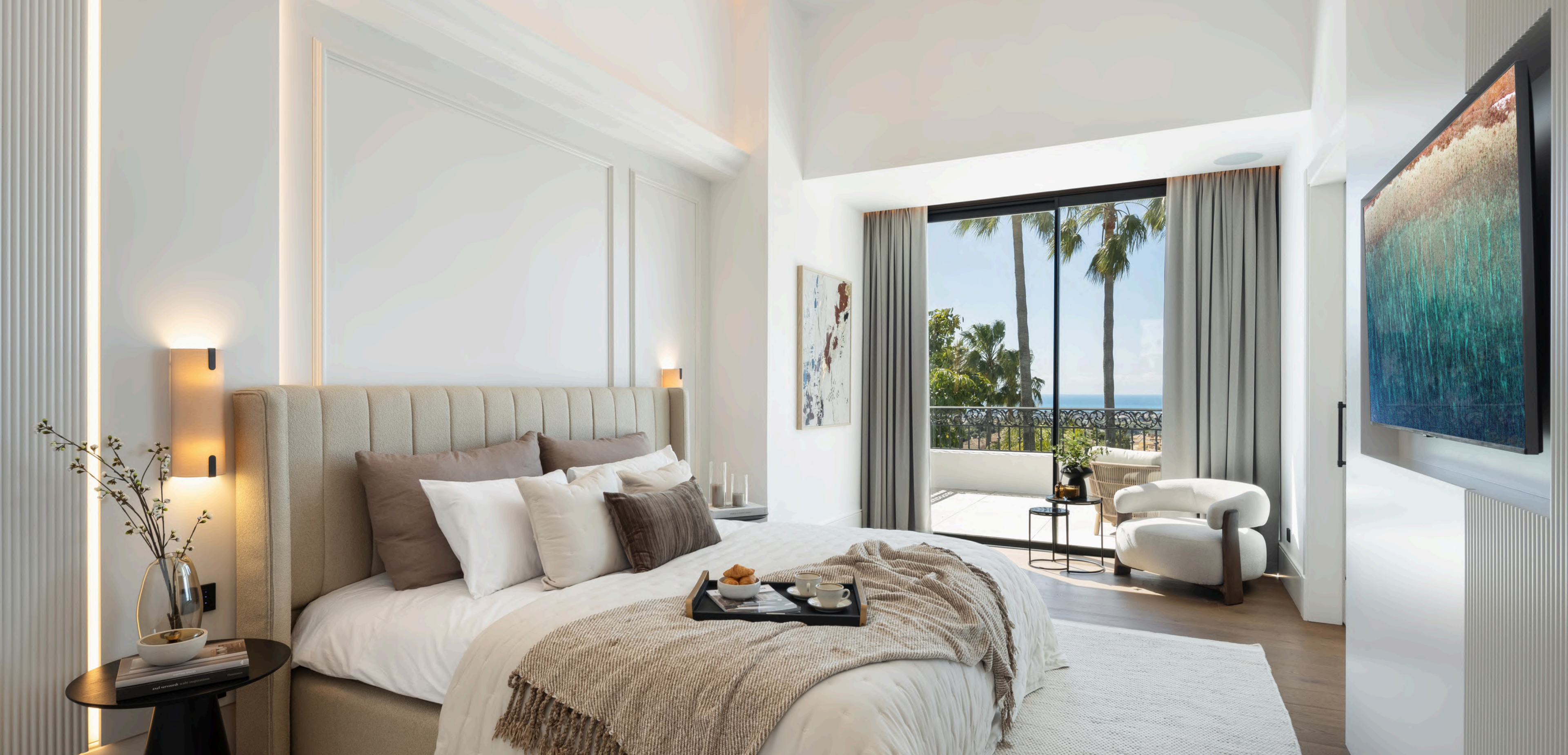
INTERIOR | BEDROOM 2